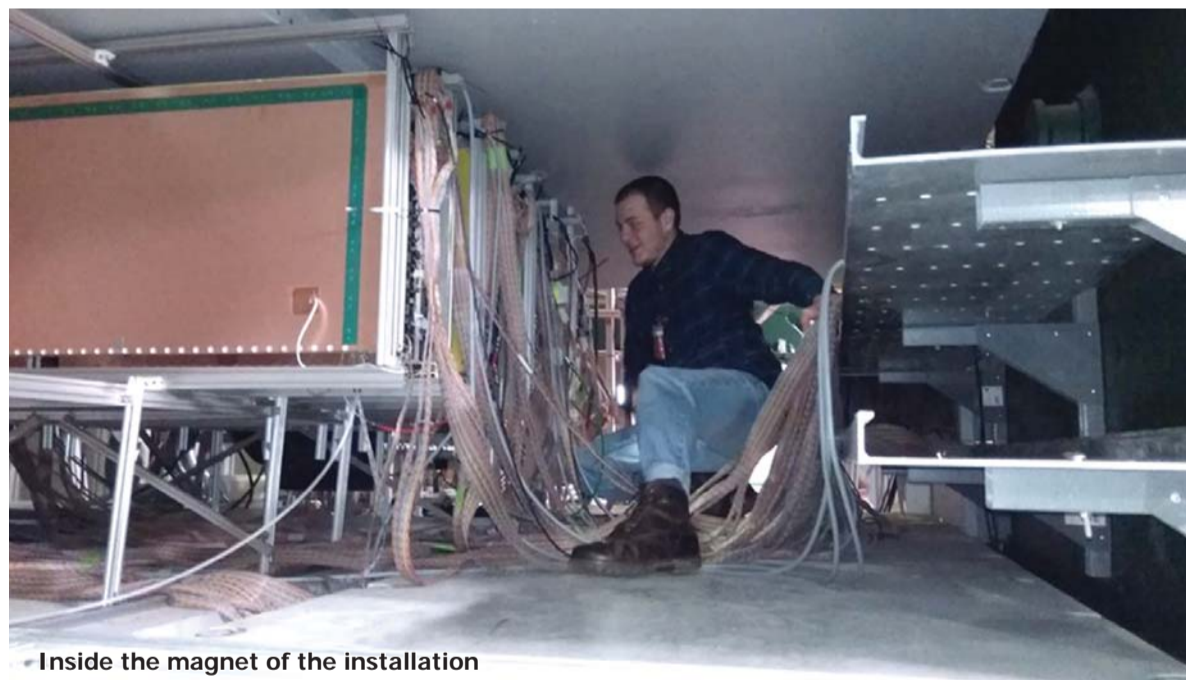
Inside the magnet of the installation